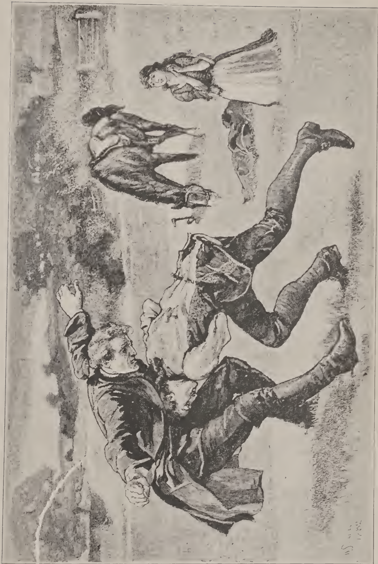
“Joseph threw his head so dexterously into the stomach of the ravisher, that he fell”